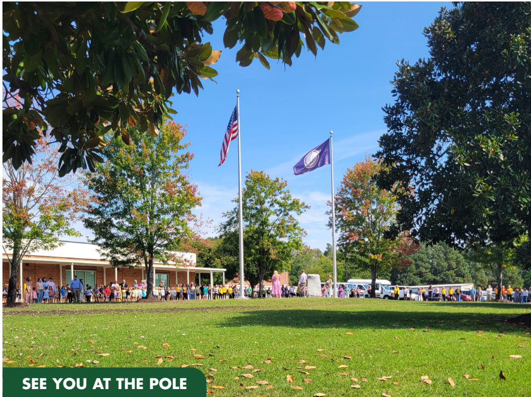
SEE YOU AT THE POLE

In October, Fellowship of Christian Athletes (FCA) members, as well as KFS parents, teachers, and lower school students, participated in a local Rise Against Hunger event, and FCA members continue to assist with food distribution at Fort Barfoot monthly.