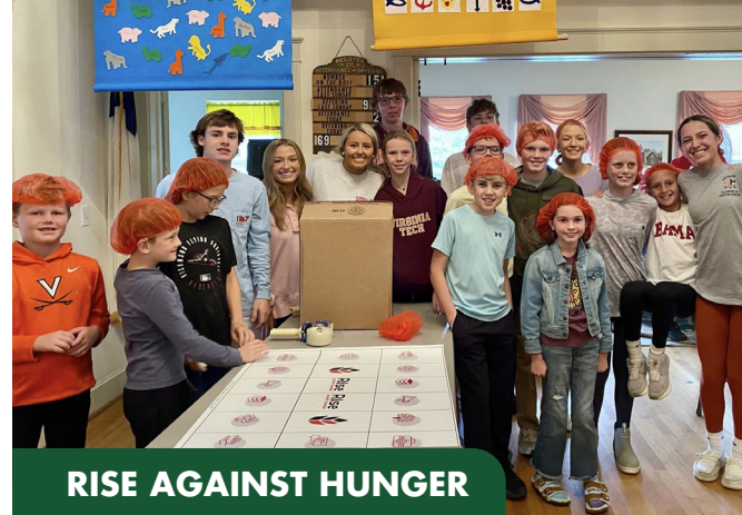
RISE AGAINST HUNGER

In September, the entire school family came together for See You at the Pole , a global event promoting student led prayer.