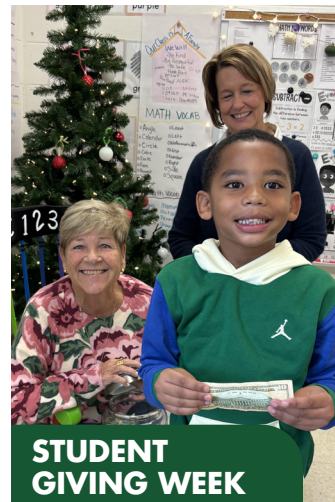
STUDENT GIVING WEEK